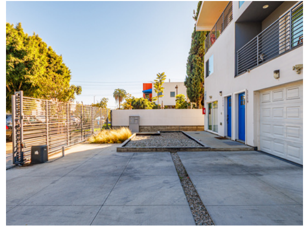
Parking, Views & More