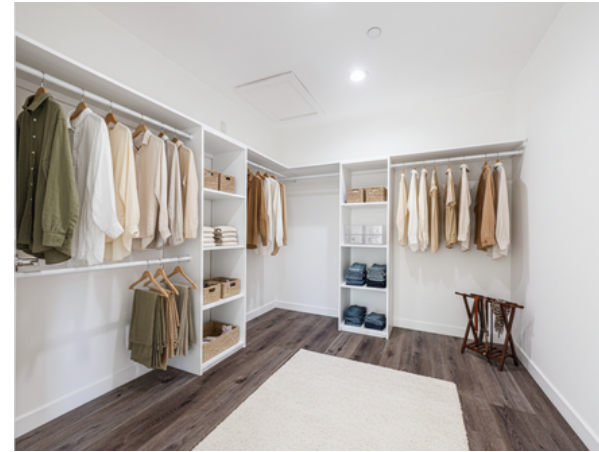
Bright & Open Bedrooms