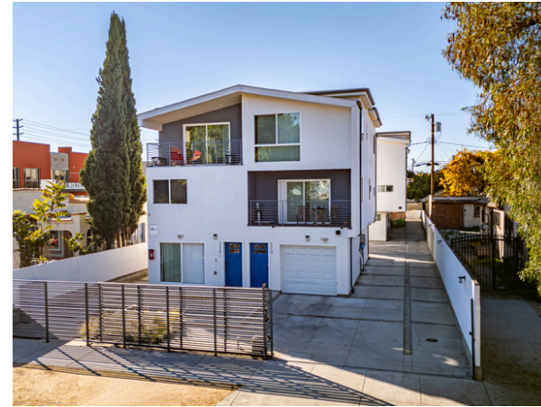
Modern Luxury Exterior